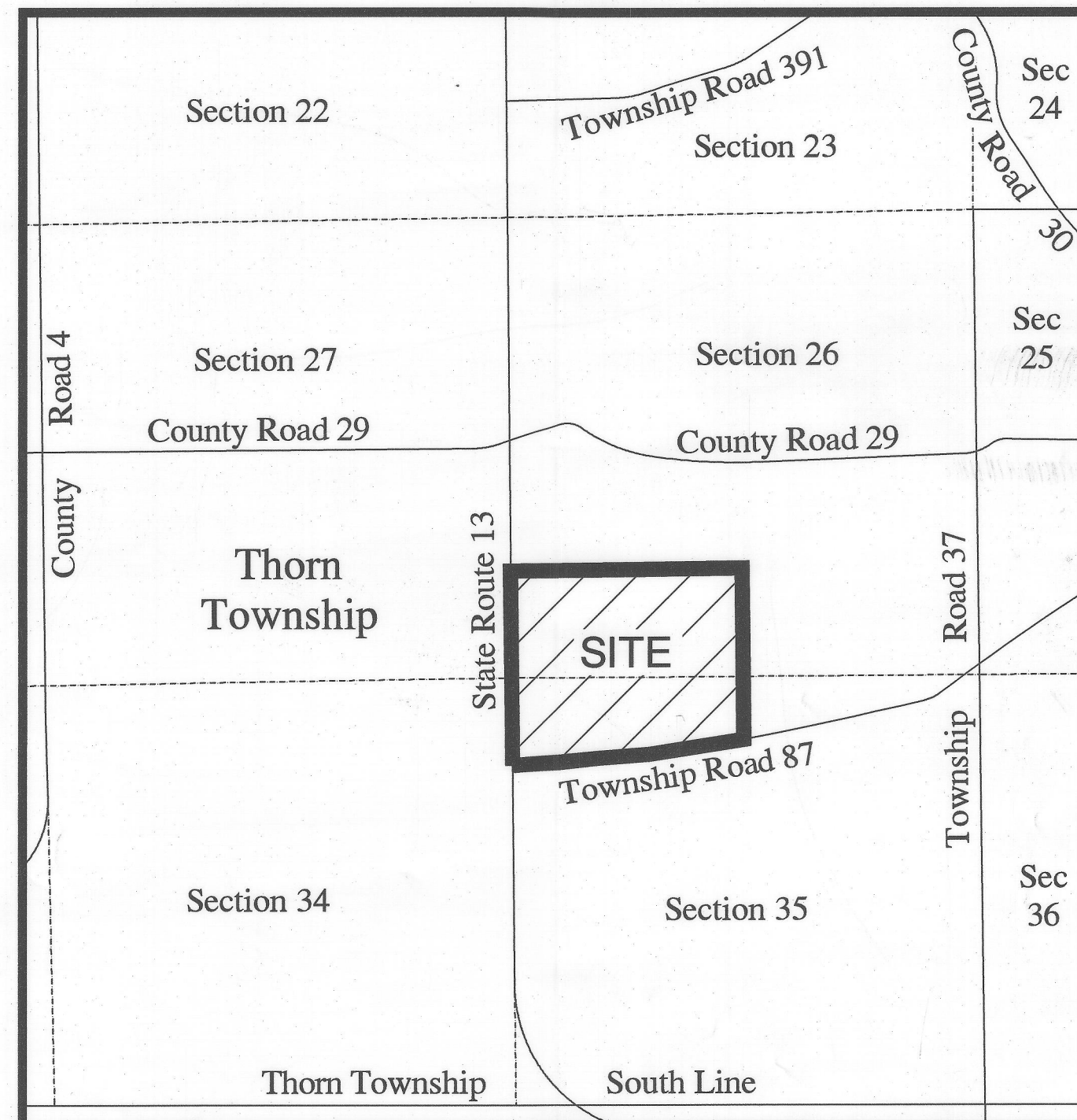
LOCATION MAP NO SCALE

Township of Thorn, County of Perry, State of Ohio, part Southwest Quarter Section 26 & Part Northwest Quarter Section 35, Township 18N, Range 17W, of the Congress Lands.